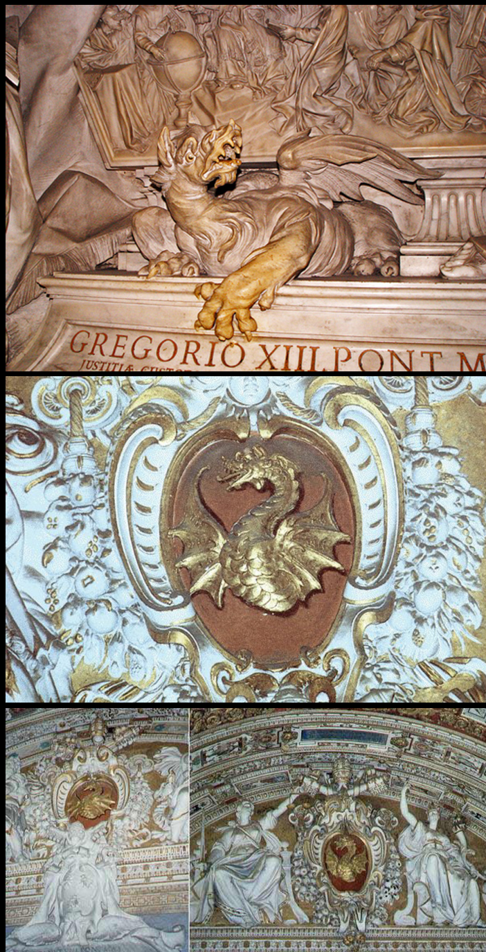
The Vatican Floor

Click on the image for a bigger better view