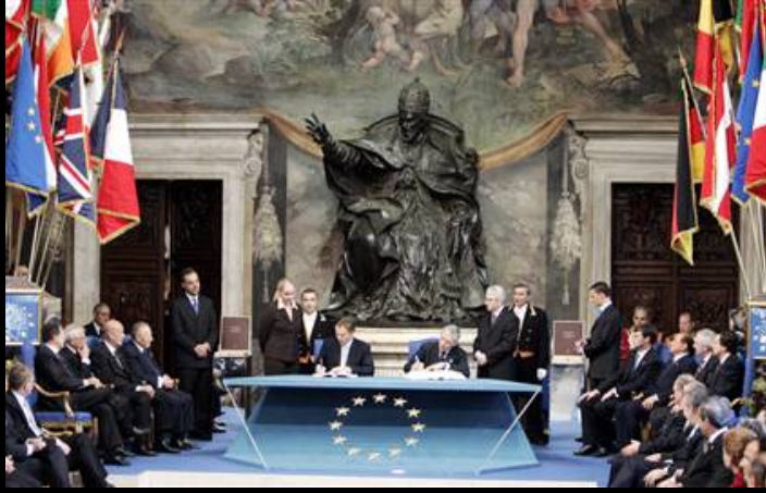
British Prime Minister Tony Blair, signs the EU Constitution in the Campidoglio, the political and religious center of ancient Rome, and current home of Rome's city hall. Oct. 29, 2004

Do you have the Mark Of The Beast or The Mark Of God?