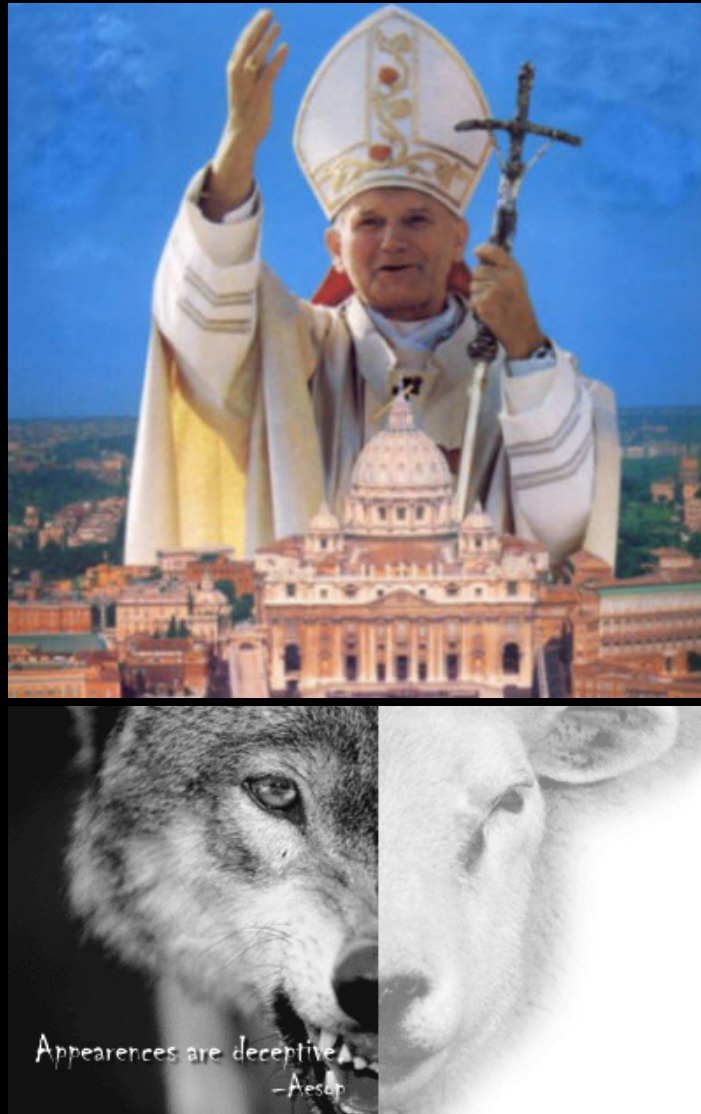
The Vatican Built In The Image Of The Roman Empire

5 And there was given unto him a mouth speaking great things and blasphemies; and power was given unto him to continue forty and two months. (1260 Days/Years) 6 And he opened his mouth in blasphemy against God, to blaspheme his name, and his tabernacle, and them that dwell in heaven. 7 And it was given unto him to make war with the saints, and to overcome them: and power was given him over all kindreds, and tongues, and nations. 8 And all that dwell upon the earth shall worship him, whose names are not written in the book of life of the Lamb slain from the foundation of the world. 9 If any man have an ear, let him hear. 10 He that leadeth into captivity shall go into captivity: he that killeth with the sword must be killed with the sword. Here is the patience and the faith of the saints.