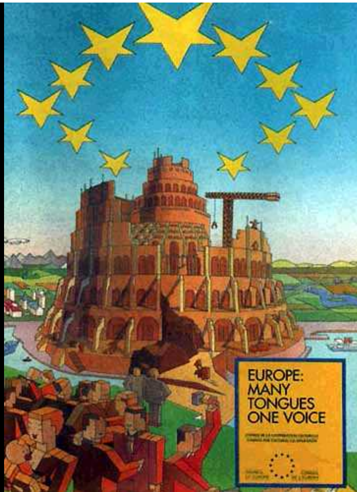
European Union Flag portrays the 12 Tribes Of Israel Which they are NOT!