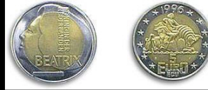
1996 Euro Coin