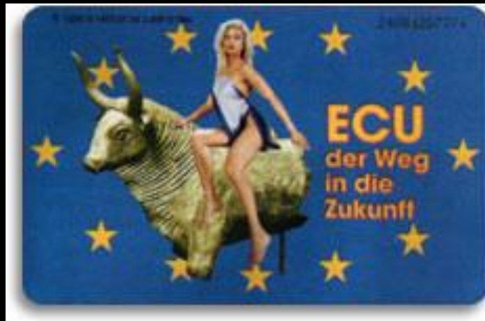
Sculpture outside the Council of Ministers Office in Brussels, Belgium