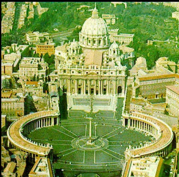
The Vatican Built in the image of the Roman Empire

17 For God hath put in their hearts to fulfil his will, and to agree, and give their kingdom unto the beast, until the words of God shall be fulfilled.