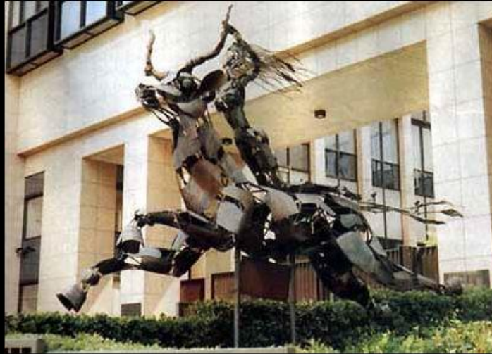
Cover of May 2000 Der Spiegel Magazine