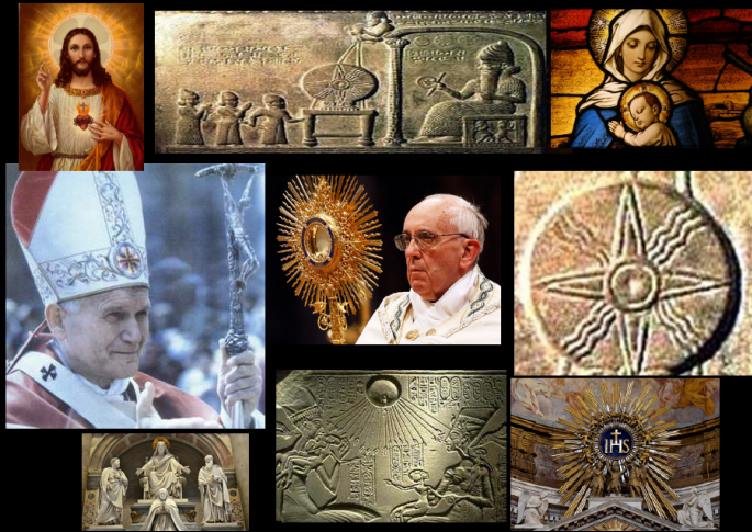
St Peter's chair at the Vatican. Notice the sun... Click on the image for a larger view